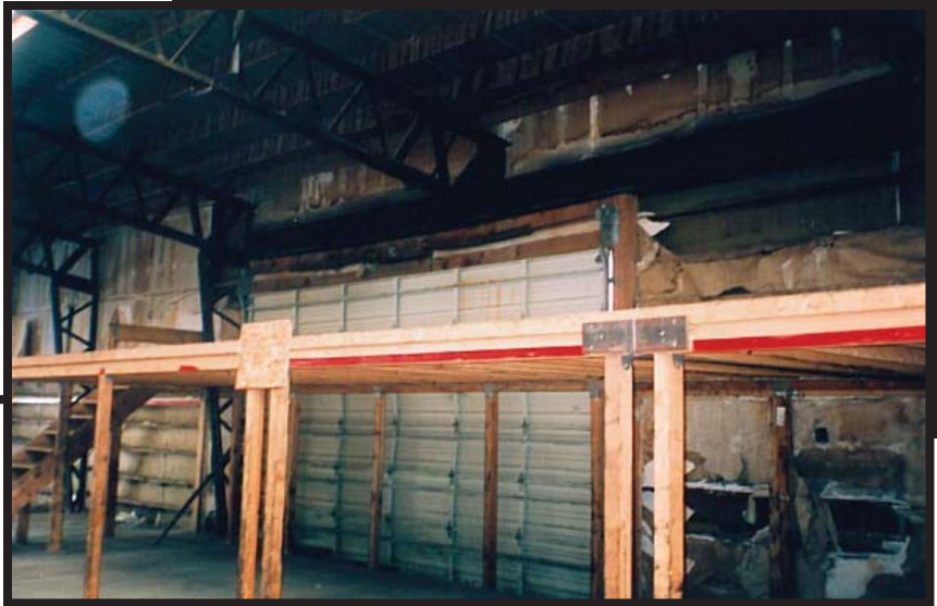
Large Over Head Door - Racks